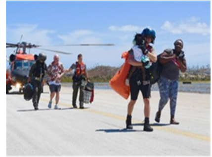
A U.S. Coast Guard Air Station Clearwater MH-60 Jayhawk helicopter crew evacuates displaced adults and children to safety in Marsh Harbour, Bahamas, Sept. 5, 2019. An Air Station Miami HC-144 Ocean Sentry crew transported the survivors from Marsh Harbour to Nassau.